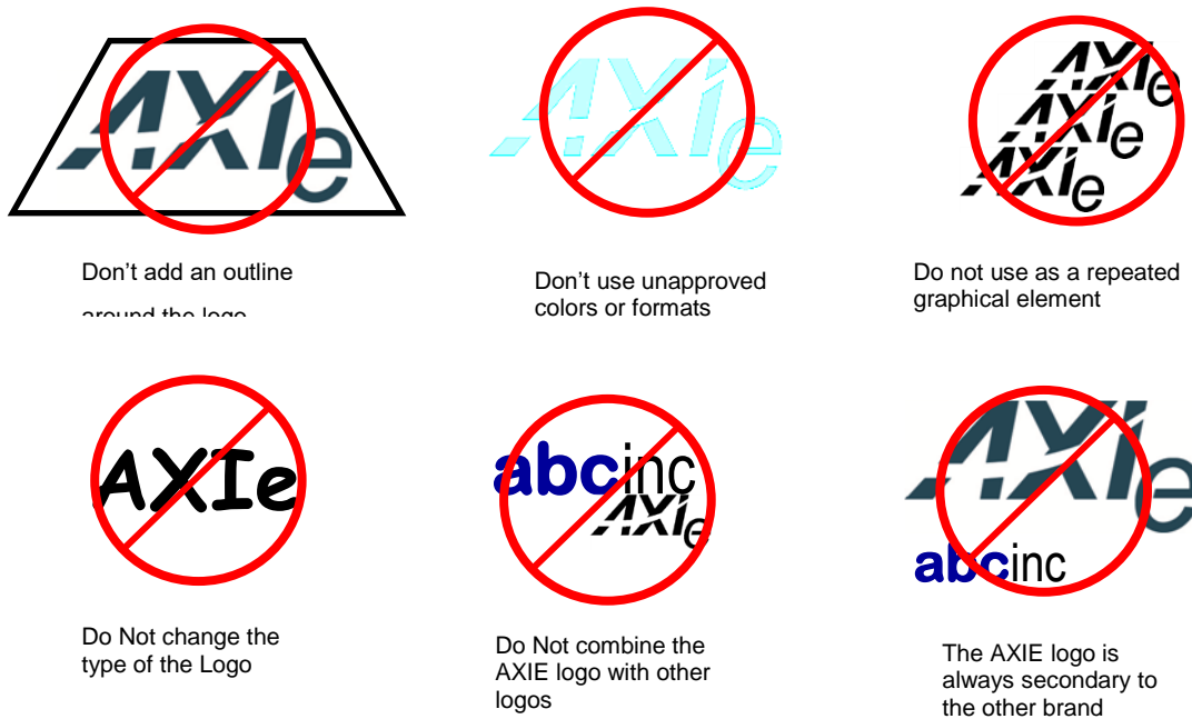
Figure 5 Examples of unacceptable AXIe logo usage

The AXIe logo shall not be altered or distorted. Some examples of unacceptable usage are shown in Figure 5.